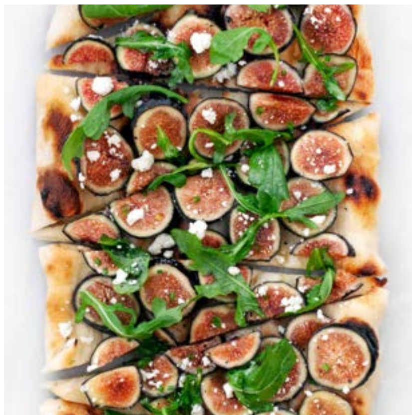
Fig & Tomato Arugula Flatbread