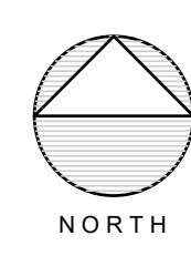
VICINITY MAP - RIO GRANDE VALLEY